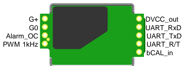
Figure 2. Diffusion Pin assignment